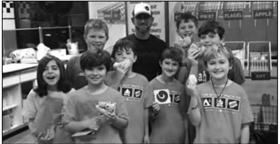
Cub Scouts not only enjoyed learning how to make a bagel but they enjoyed eating it even more thanks to Bage Masters in Shrewsbury.