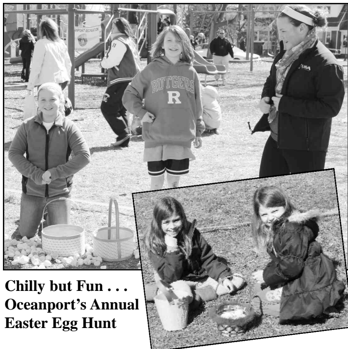
Chilly but Fun . . . Oceanport's Annual Easter Egg Hunt

Please print clearly and return form and payment to: Oceanport Lions Swim Club P.O. Box 64, Oceanport, NJ 07757