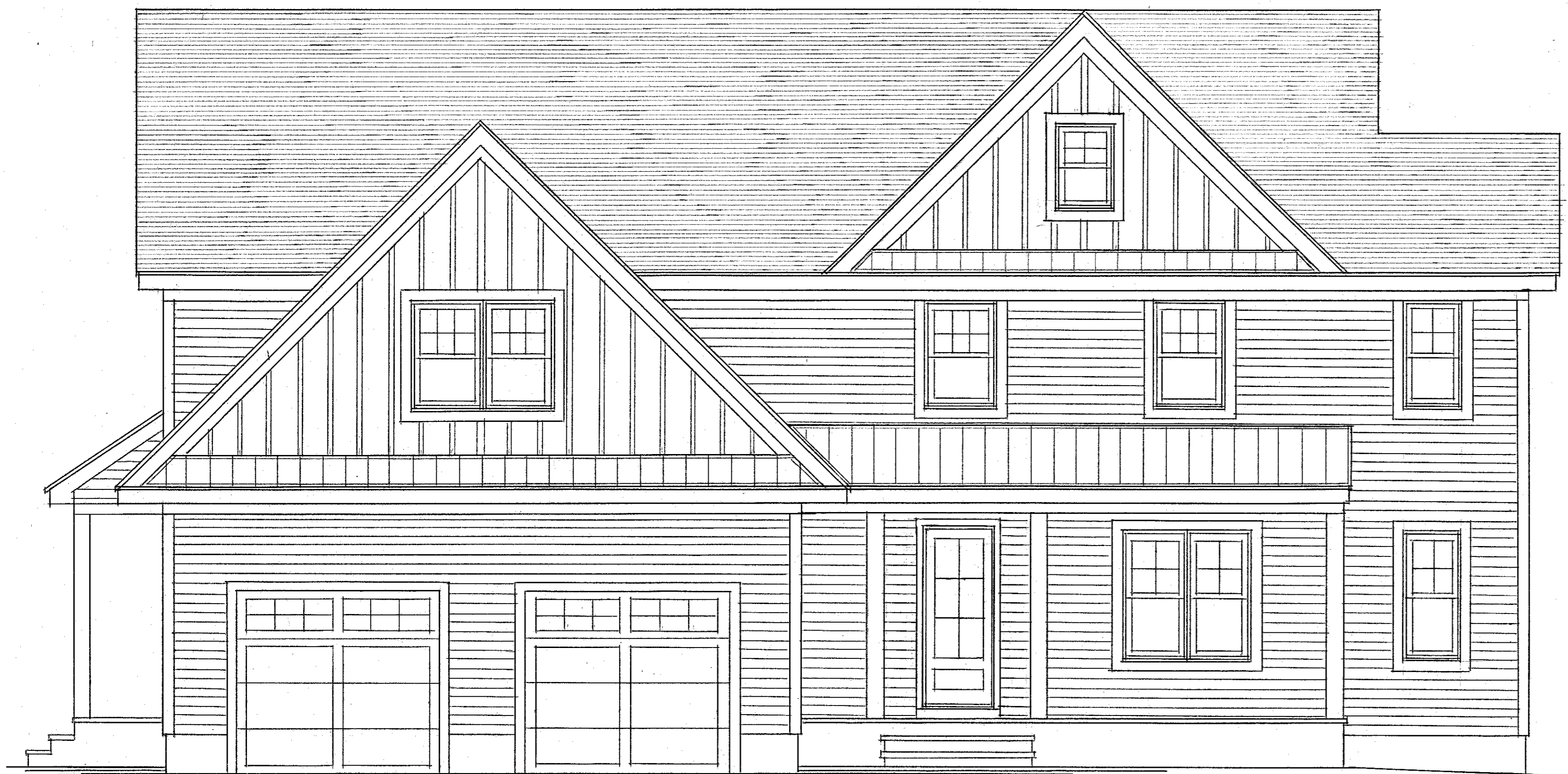
FRONT ELEVATION 1/4" = 1'-0"