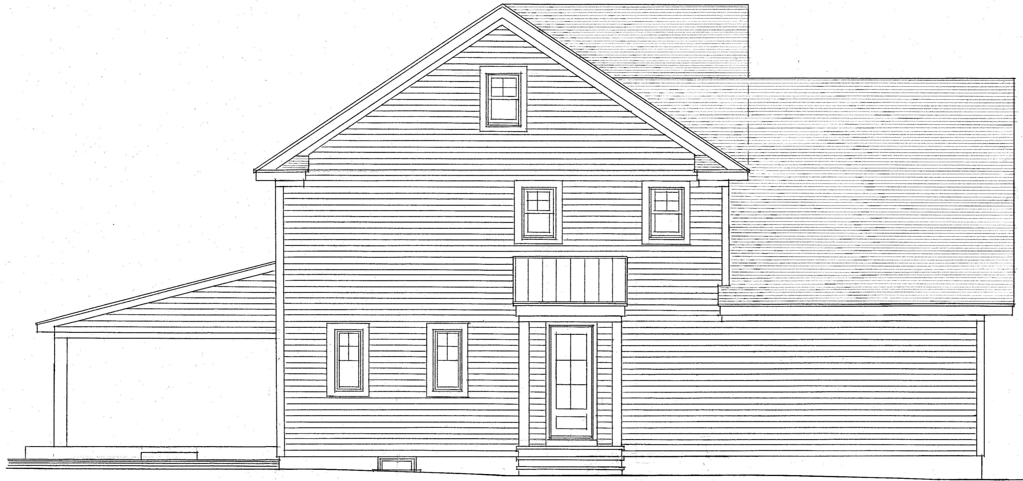
LEFT SIDE ELEVATION 1/4" = 1'-0"