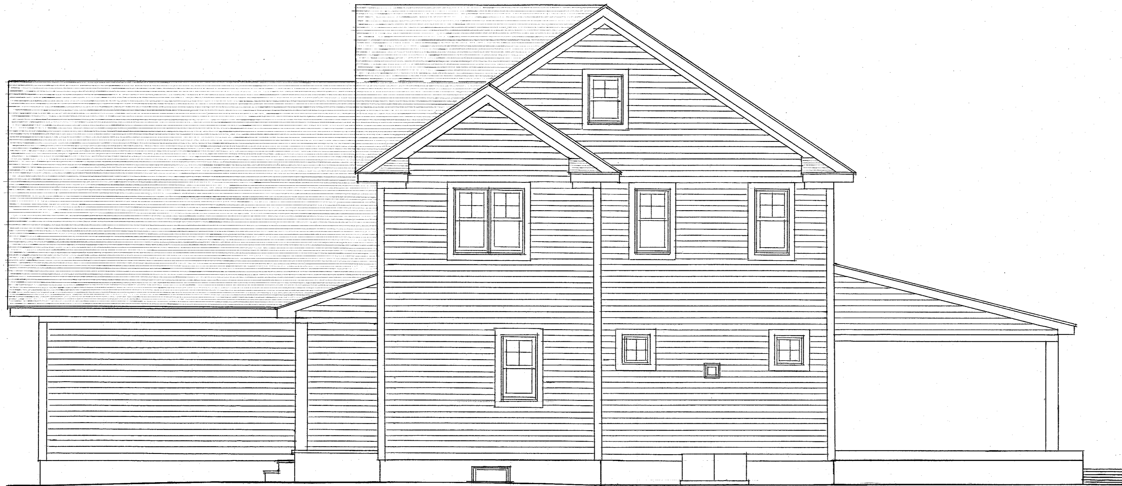
RIGHT SIDE ELEVATION 1/4" = 1'-0"