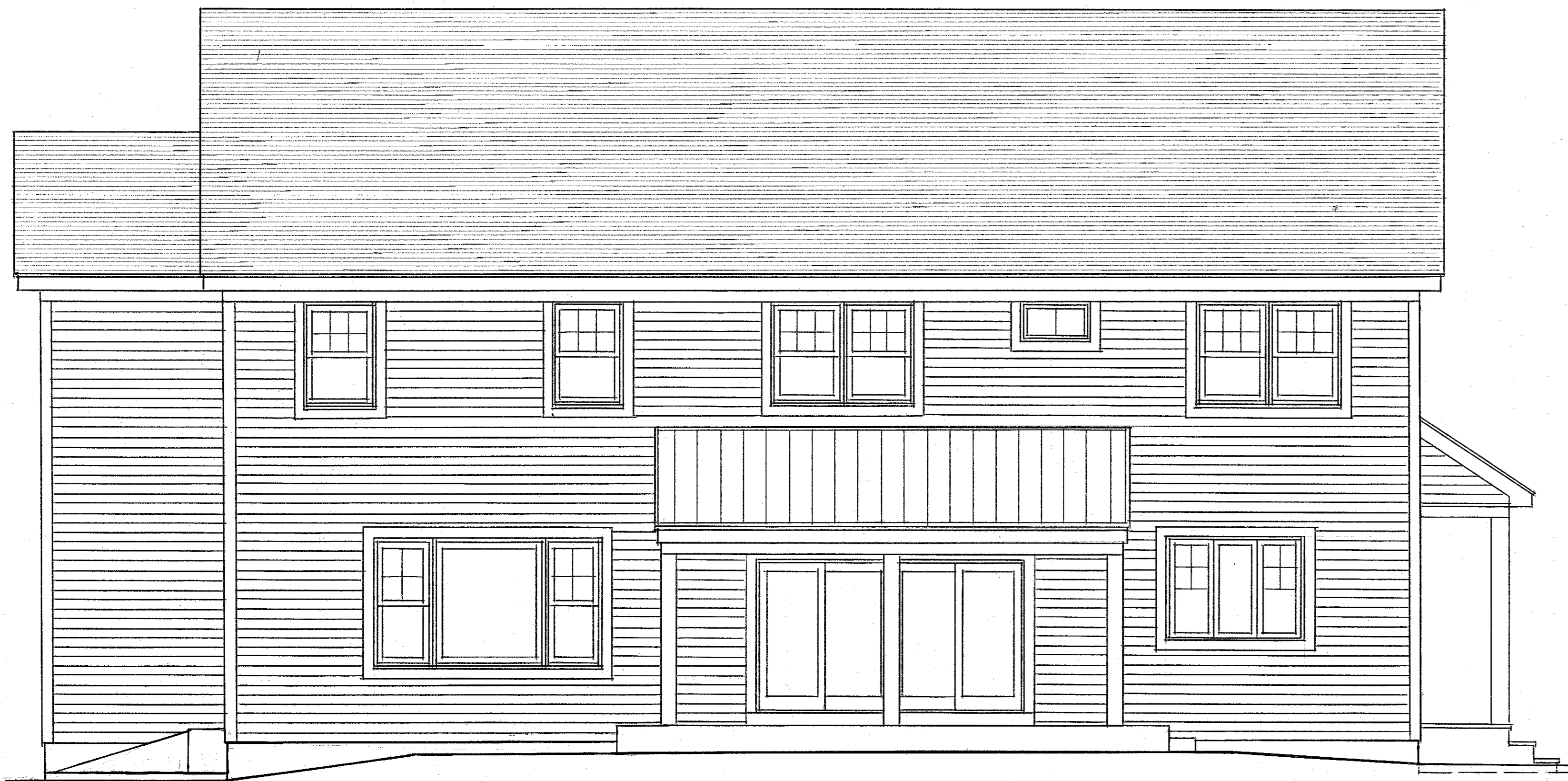
REAR ELEVATION 1/4" = 1'-0"